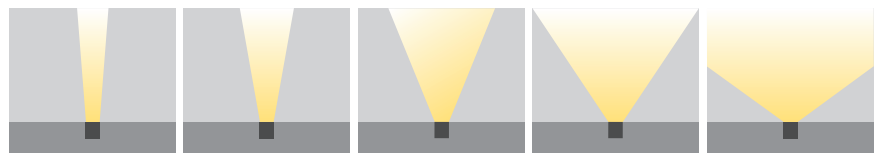
XN: Extra Narrow Angle (10°)