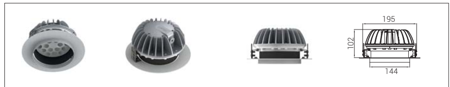
12: Deep recessed movable*