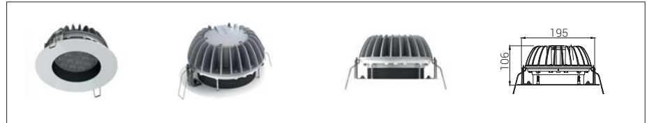
10: Fixed Deep *