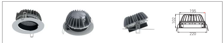
11: Deep movable*